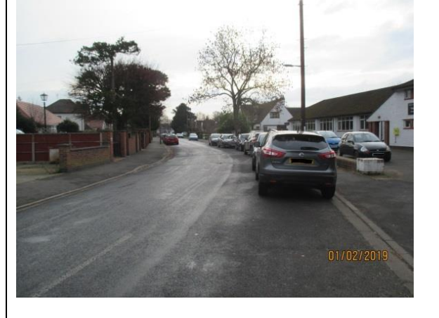
163 Attenborough Lane, to the left

Parking on Attenborough Lane – photo taken February 2019 during the daytime