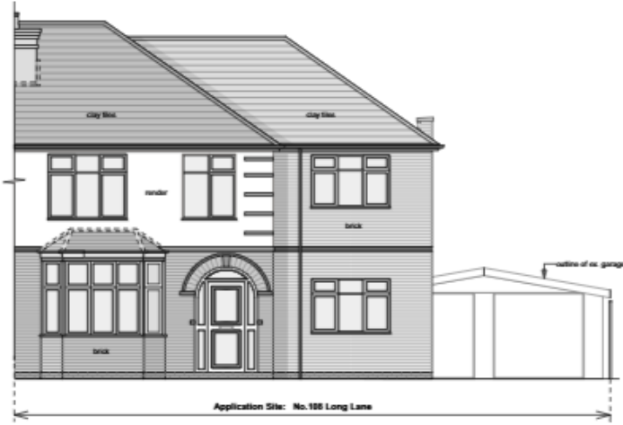
1 Front Elevation (Along Long Lane) Scale: 1:100