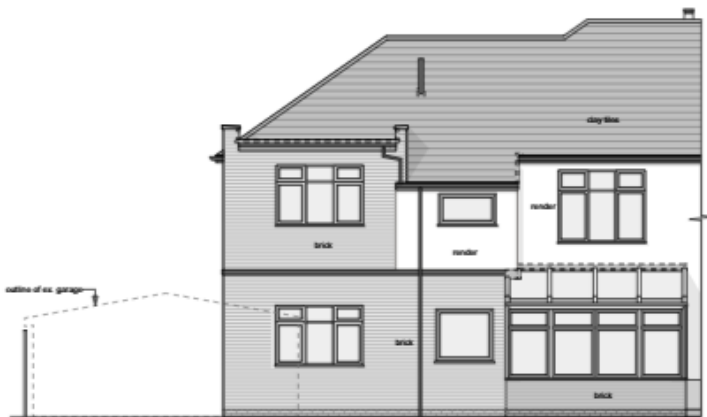
2 Rear Elevation Scale: 1:100