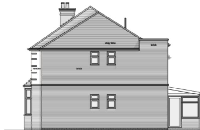
3 Side Elevation Scale: 1:100