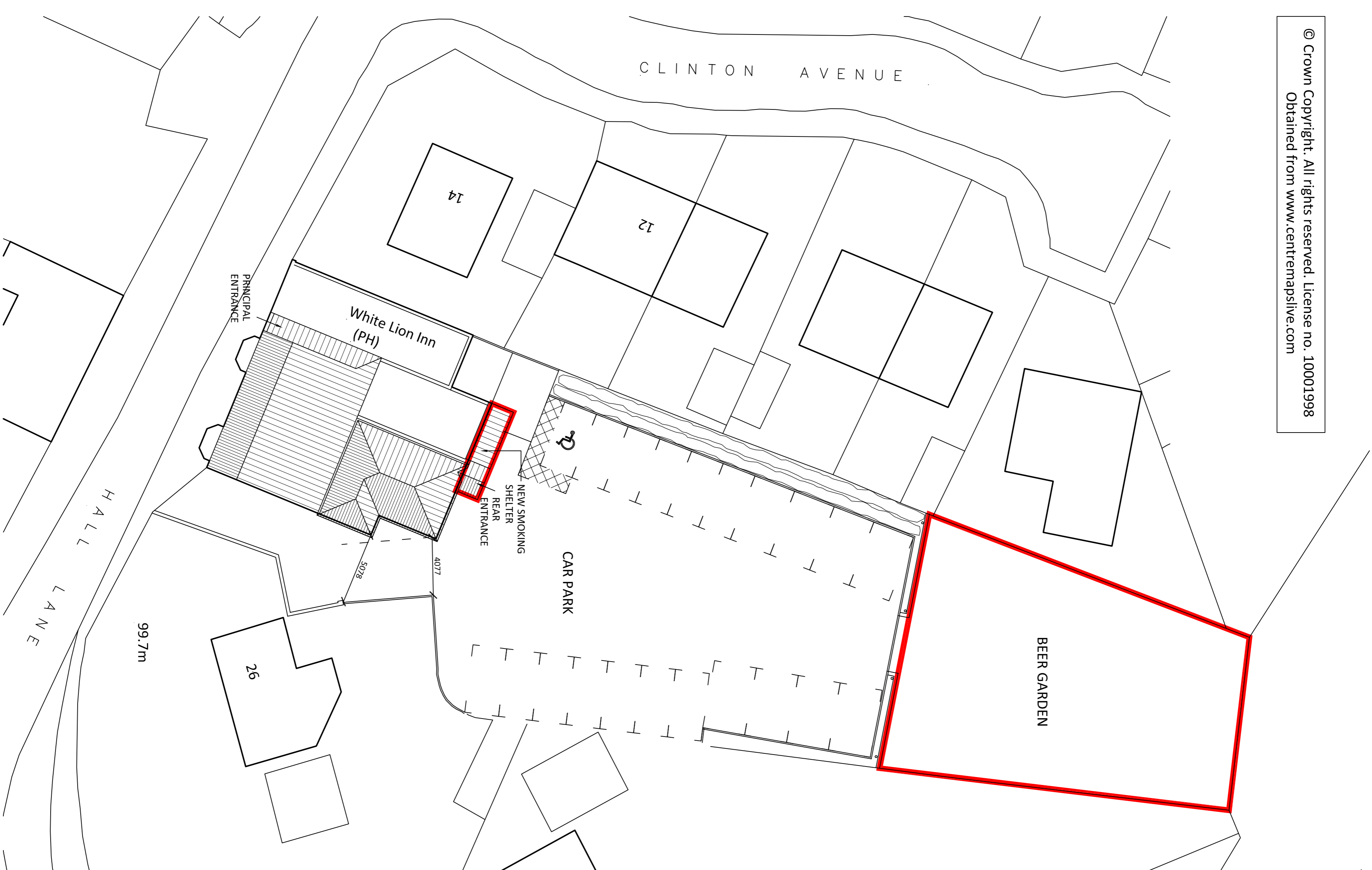
SITE BLOCK PLAN SCALE 1:200

STATE FIRE NOTICE detailing the following: The location and operation of extinguishers Call point and main control panel locations Evacuation procedures