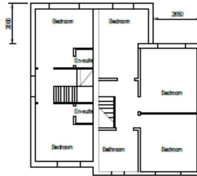
FIRST FLOOR PLAN 1:100