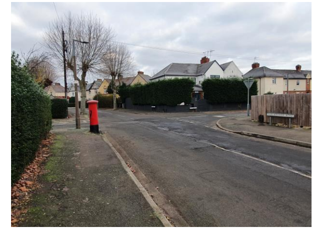
View facing north west along Marlborough Road