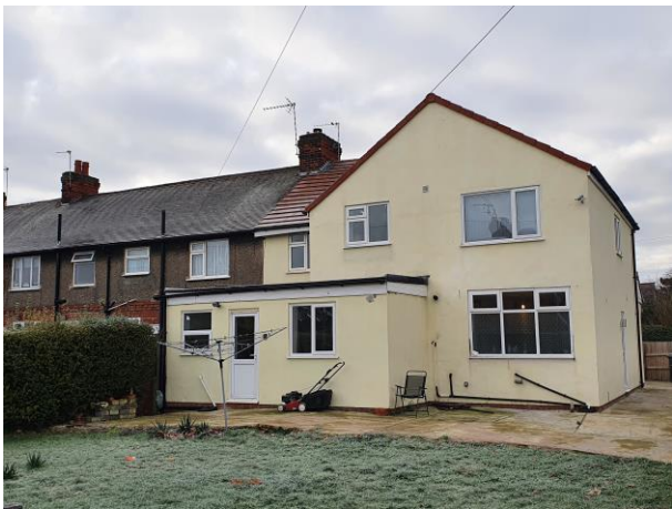
North east (rear) elevation