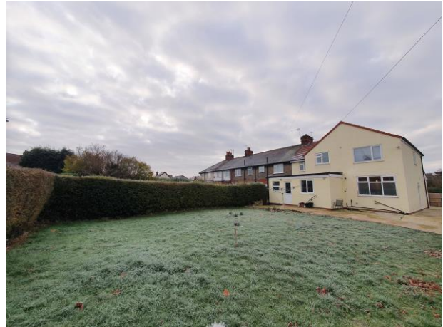
North east (rear) elevation