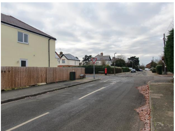
View facing south west along Hetley Road