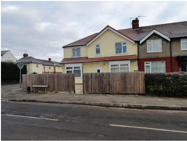
South west (front) elevation