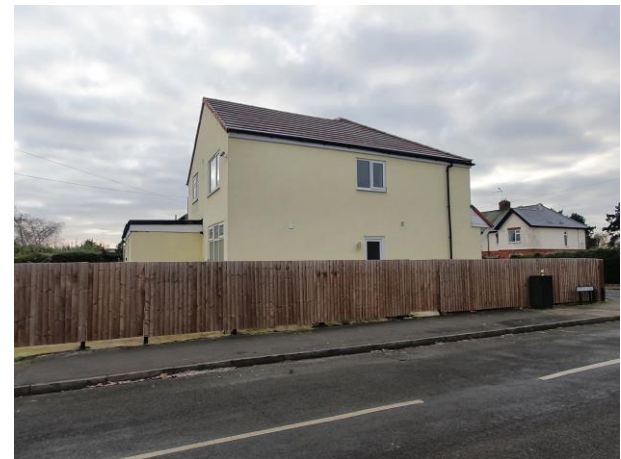
North west (side) elevation