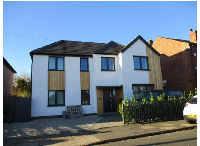
To front, no. 37 (extended and rendered).