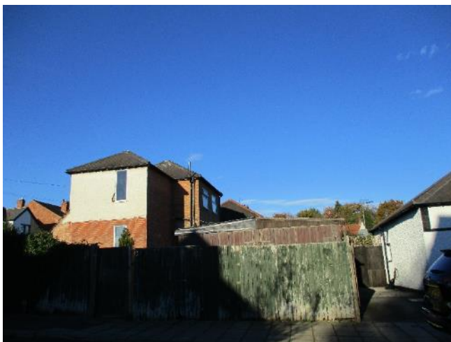
Side (south east) elevation, viewed from Cyril Avenue.