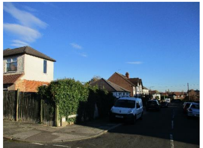
South eastern boundary with Cyril Avenue.