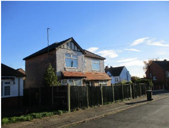
Front (south west) and side (north west) elevations.