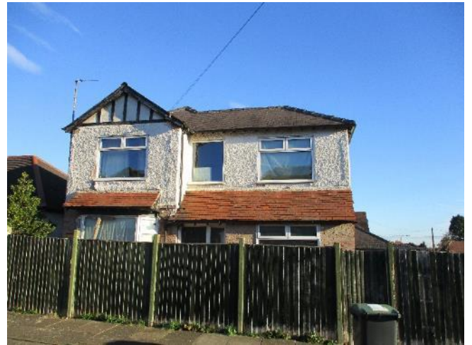
Front (south west) elevation.