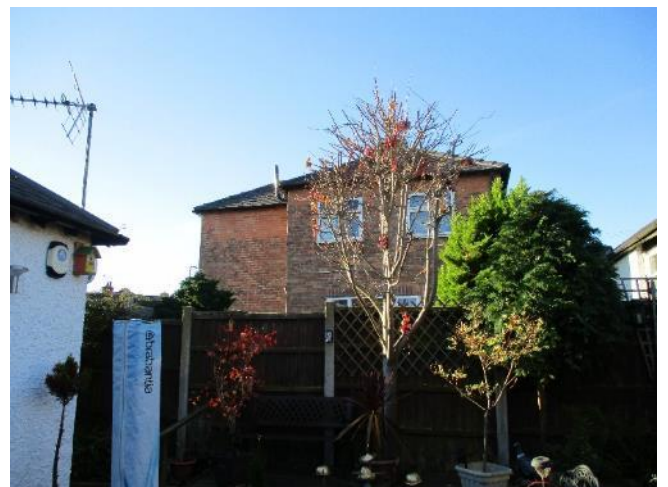
Rear (north east) elevation, view from 16 Cyril Avenue.