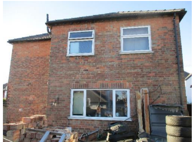
Rear (north east) elevation.