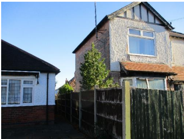
Front boundary with no. 14.