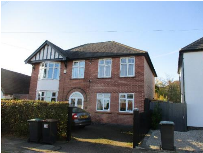
To front, no. 35 (extended).