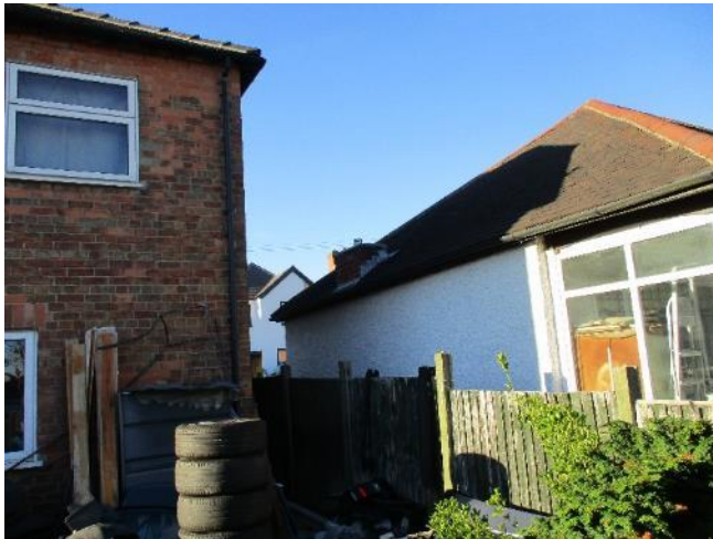
Rear boundary and side elevation of no. 14 Hope Street