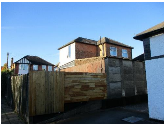
Boundary with no. 16 Cyril Avenue. and rear (north east) elevation.