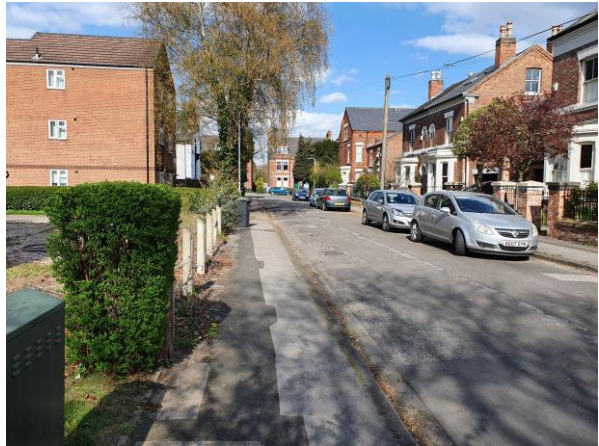
North east view of Grove Street