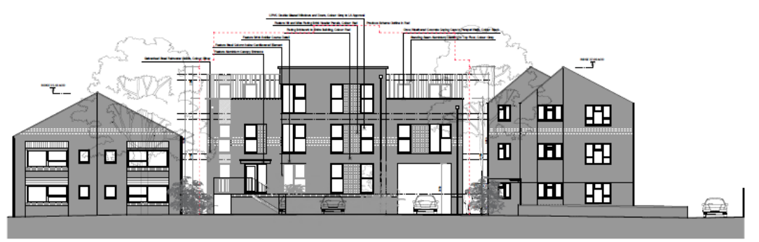
Proposed Front Street Scene Elevation - Grove Street Proposed under 21/00133/FUL