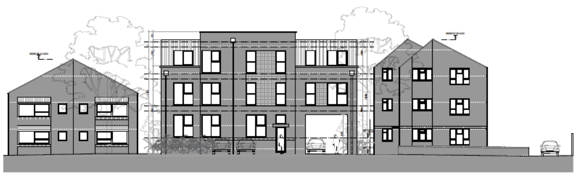
Proposed Front Street Scene Elevation - Grove Street