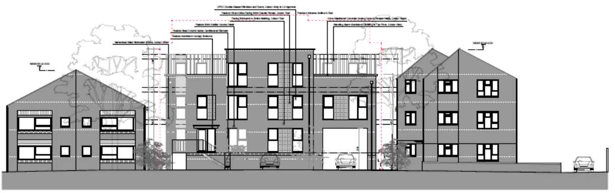
Proposed Front Street Scene Elevation - Grove Street