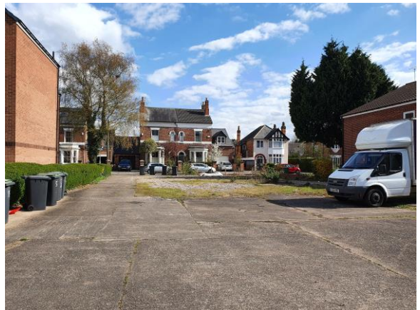
View of site facing Grove Street