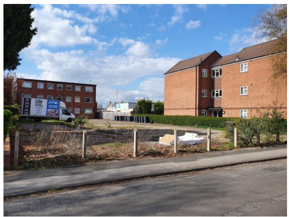
View of site from Grove Street