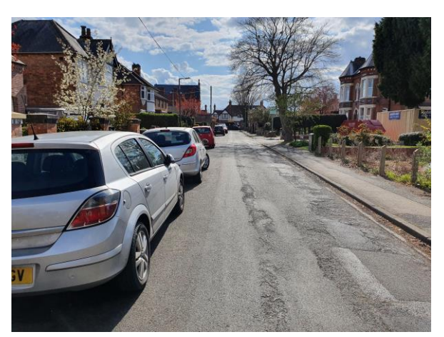
South west view of Grove Street