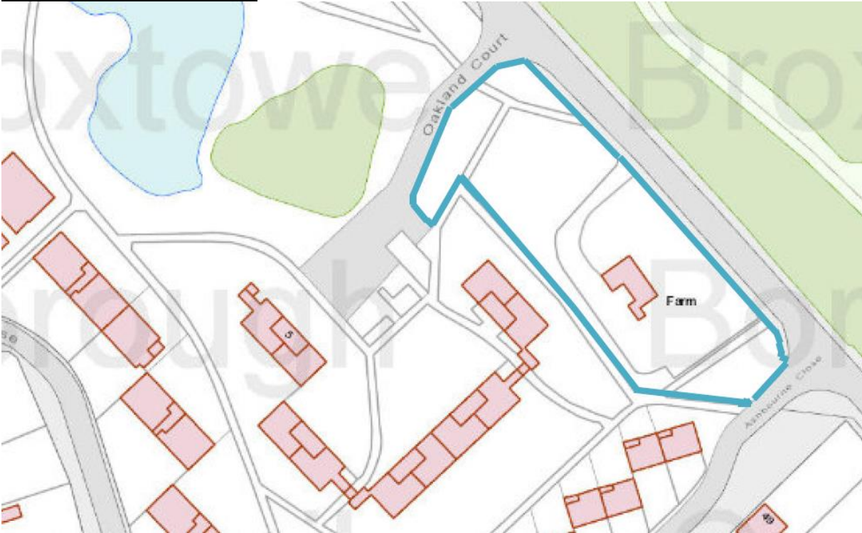
Plan 3 - 51 Ilkeston Road